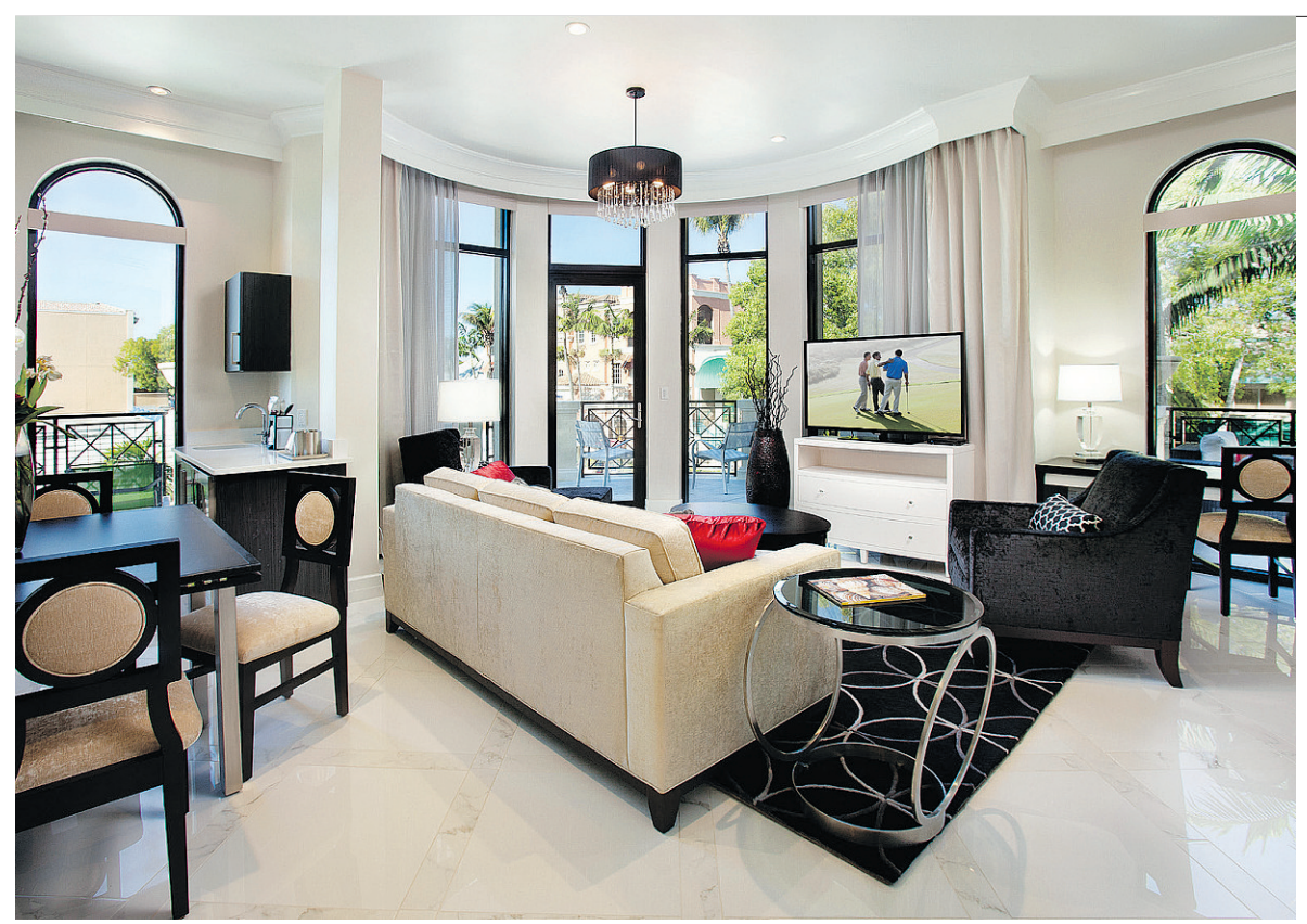
The prestigious Inn on Fifth in Naples, Fla., is offering Canadians a fourth night free in its super-posh Club Level Suites. The suites offer superior bedding, satin-trimmed robes and marble bathrooms.